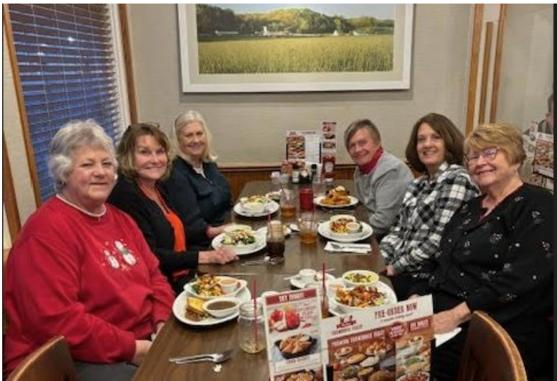
Left- Some of the ladies gathered to see the play Away in a Basement: The Church Basement Ladies in Van Wert. They stopped at the Bob Evans for dinner.